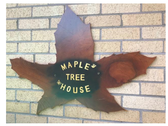
STATEMENT OF PURPOSE

Maple Tree House 110 Merthyr Mawr Road, Bridgend CF31 3NY